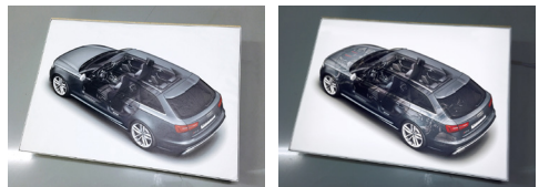
Day View by day